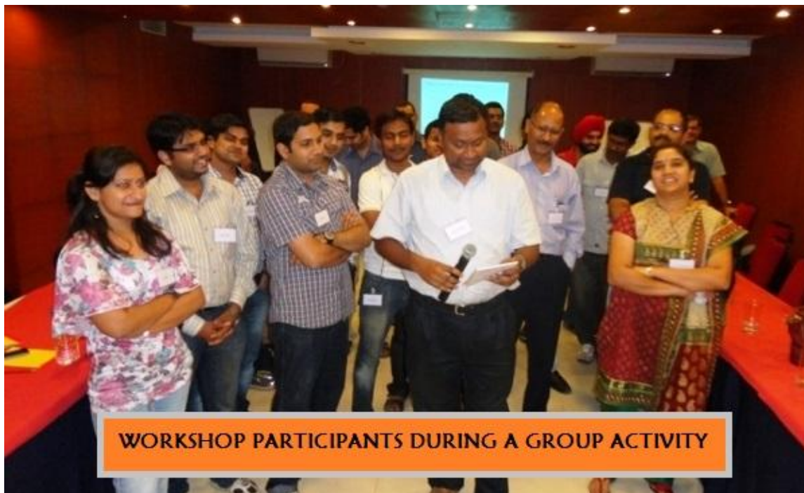
WORKSHOP PARTICIPANTS DURING A GROUP ACTIVITY

We will not just talk about numbers or products but will actually help you in enhancing your thinking and commitment level so that you can get in control of your financial life. There will be lot of interactions, some group exercises and powerful conversations which will give your financial life a whole new shape and direction. The program is designed in such a way that there is something for all kinds of investors.